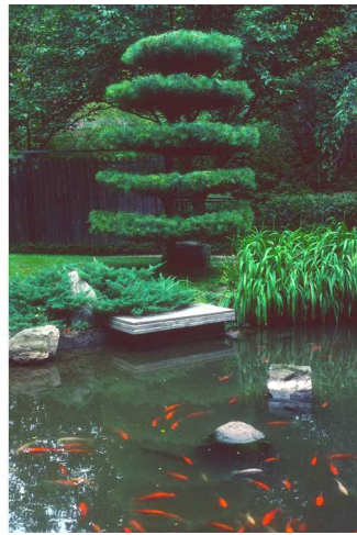
Above: July 1976

Meetings are held at the Township office, 11 General Warren Blvd. Suite 1, Malvern